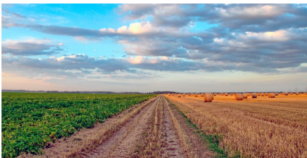
Fig. 1. The bumpy path towards biochar standardization and legalization harmonization in the European Union

In parallel to this, biochar producers and biochar users in a number of EU countries were partly successful in