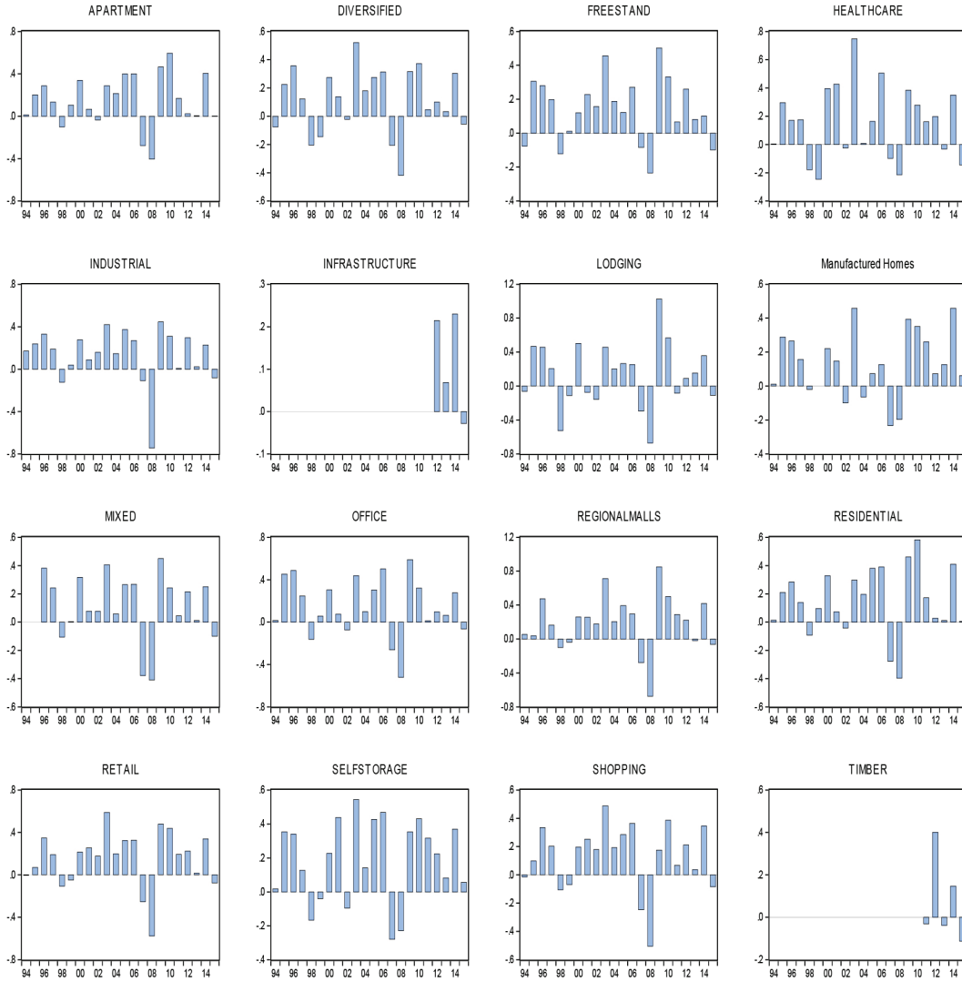
Figure 1. Annual returns of REIT subsectors