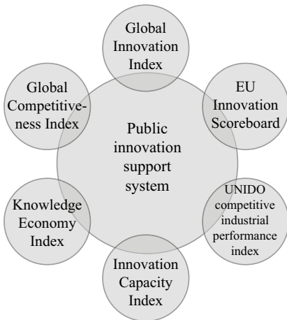
Fig. 2. Indexes applicable for the comparative analysis of public innovation support systems

example – consumer price index is a set of prices (with a particular weigh) that is expressed in a relative, synthetic and numeric form. In the Figure 2 the summary of different indexes that could be used for public innovation support systems analysis is presented. In this case, the innovation index – the synthetic indicator that not only reflects innovation activities and related public support but also ranks countries/economies in terms of their environment to innovation and their innovation outputs.